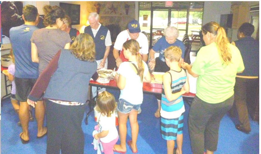
Families at dinner